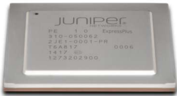
Figure 1: The custom-built Juniper Q5 ASIC

The QFX10002 switches are built with Juniper custom Q5 ASICs, which offer industry-leading performance and scale with 1 Tbps of switching throughput and support for network virtualization with VXLAN, Ethernet VPN (EVPN), and MPLS. The Q5 ASIC is embedded with on-chip analytics capabilities, along with Precision Timing Protocol and high-frequency monitoring.